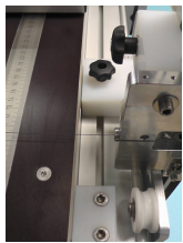
RULERS AND ADJUSTABLE STOP